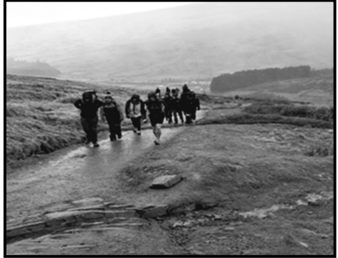
The climbers/hikers in action!

What an adventure it was, and everyone who participated hopes there will be other adventures ahead.