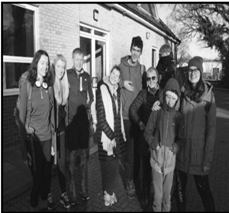
The group that made the climb.

This hike aimed to not only raise money for Many Hands but also to connect with our neighbours with the overall aim being uplifting communities: Lochinvar Zambia with Sythwood neighbourhood and Salvation Army Woking UK.