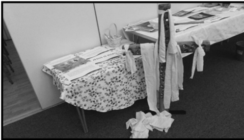
Small cross with strips of bandage which we could take away with us if we wished. They would serve as a reminder that Jesus rose from the dead and the grave clothes were left in the tomb.