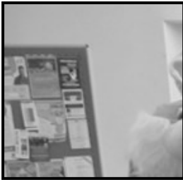
Visit of the Easter Bunny

Captain Vanessa concluded the morning when, surrounded by children, she knelt on the floor and told the Easter story Godly Play style.