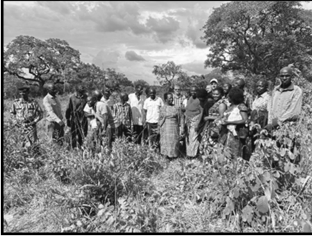
Staff at the Lochinvar Community School in Zambia

old but precious song by the late General Orsborn, ‘When shall I come unto the healing waters’.