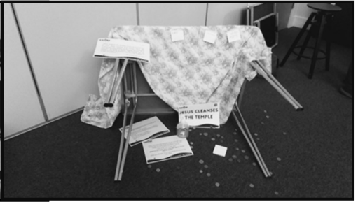
Jesus cleanses the Temple and the money lenders' tables are over turned