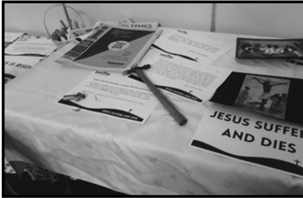
Hammer, nails and a small cross to knock them into.