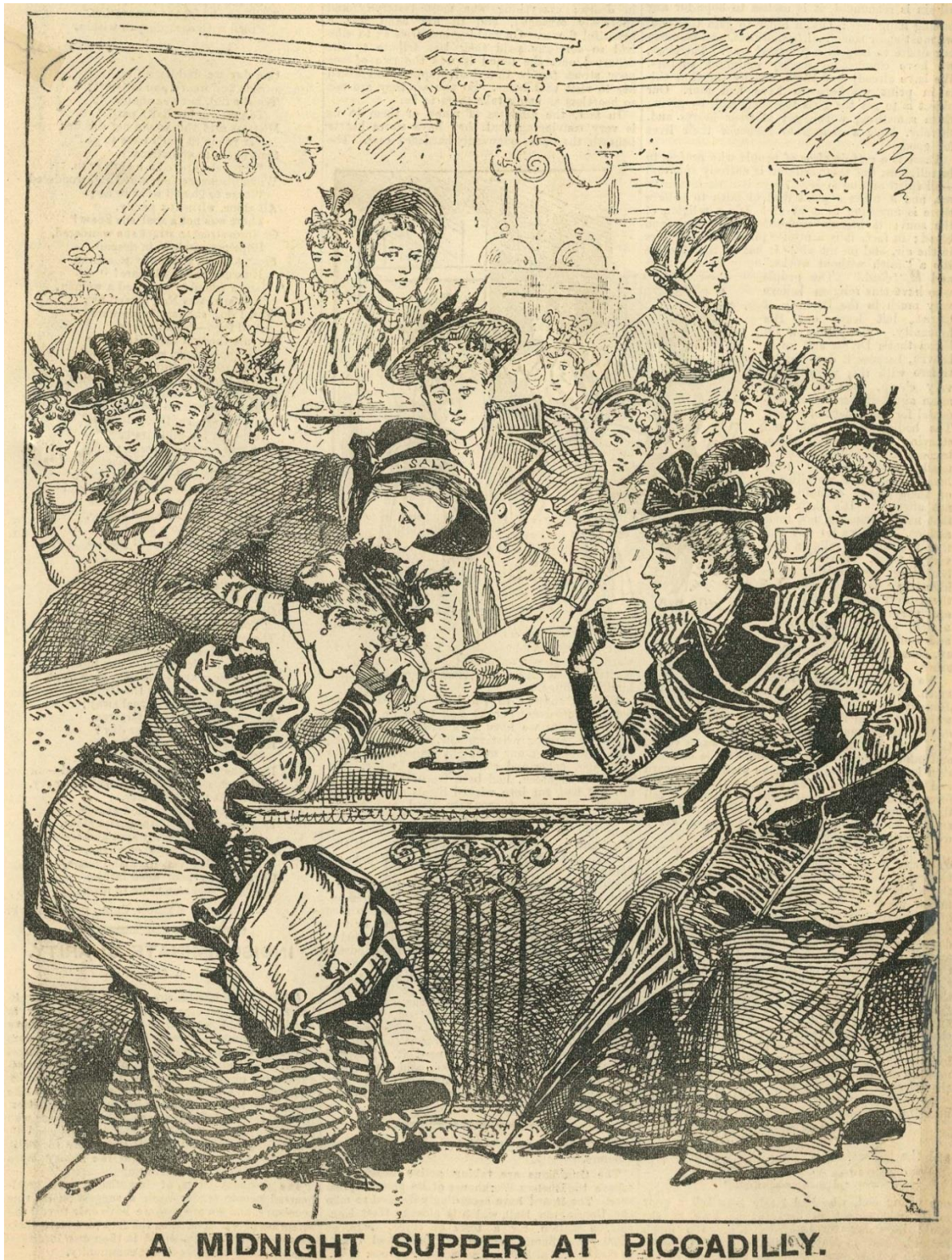
A MIDNIGHT SUPPER AT PICCADILLY.