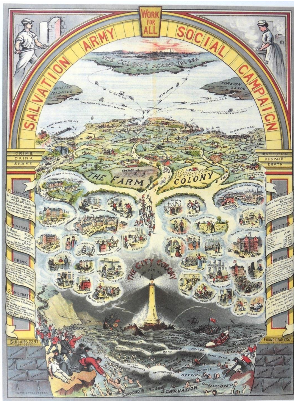
Frontispiece of In Darkest London and the Way Out (1890) by General William Booth, illustrating the 'way out' of the deprivation of 'Darkest England' through Salvation Army colonies.

The word 'colony' is now inextricably linked with ideas of empire. While Booth did not propose the Darkest England Scheme with the intention of subjugating other peoples and cultures, there are common points between his use of the term and that of contemporary imperialists. The term 'colony', for Booth, indicated the expansion of The Salvation Army's work, allowing for the settlement of dispossessed people in new areas. The 'colonisation' of parts of Darkest England (and the rest of the world) meant changing these areas to institute a Salvationist approach to life.